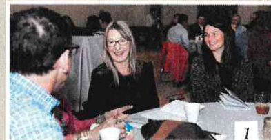
Conversation about the message

Seven Weeks - Mondays September 9th – October 21st 6:15PM – 8:30 PM