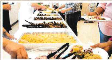
A great (free) dinner