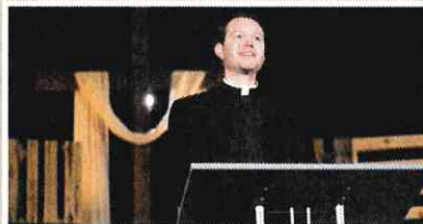
An engaging video message