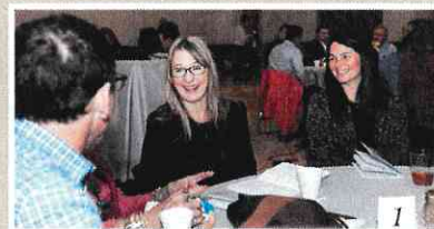
Conversation about the message

Seven Weeks - Mondays September 9th – October 21st 6:15PM – 8:30 PM