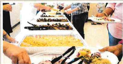
A great (free) dinner