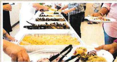
A great (free) dinner