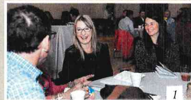
Conversation about the message

Seven Weeks - Mondays September 9th – October 21st 6:15PM – 8:30 PM