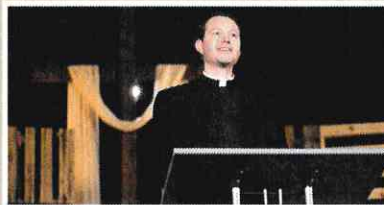
An engaging video message