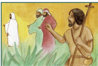
- Jn 1:38-39a

Jesus turned and saw them following him and said to them, "What are you looking for?" They said to him, "Rabbi"—which translated means Teacher—"where are you staying?" He said to them, "Come, and you will see."